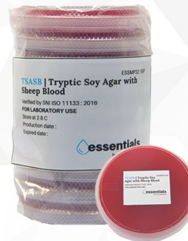
Tryptic Soy Agar With Sheep Blood (TSASB)