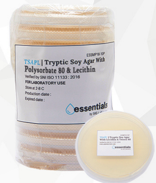
Tryptic Soy Agar with Polysorbate 80 and Lecithin (TSAPL)