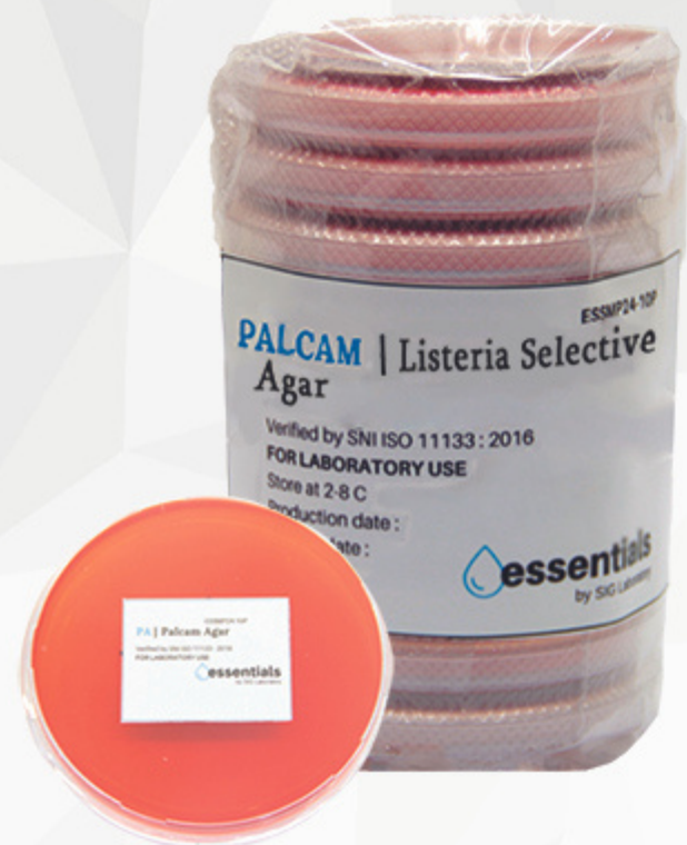
PALCAM Listeria Selective Agar (PALCAM)