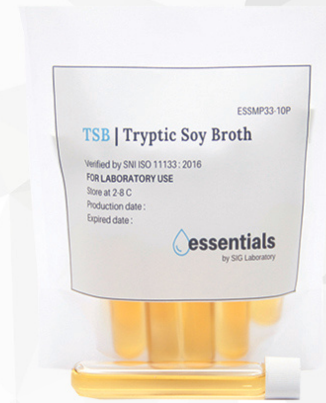
Tryptic Soy Broth (TSB)