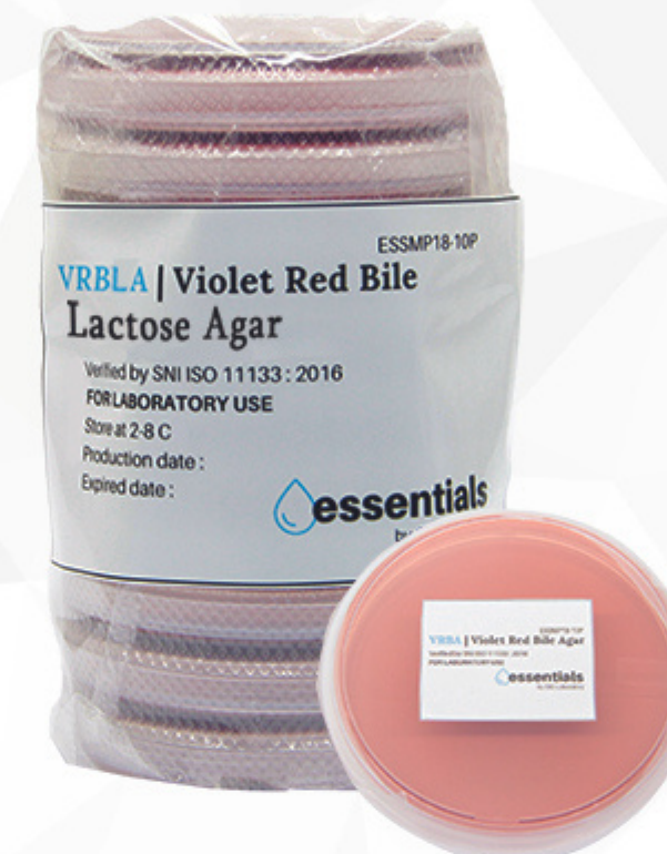
Violet Red Bile Lactose Agar (VRBLA)