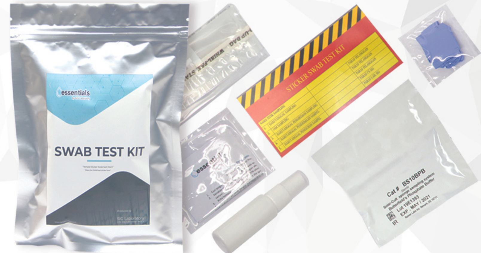
SWAB Test Kit