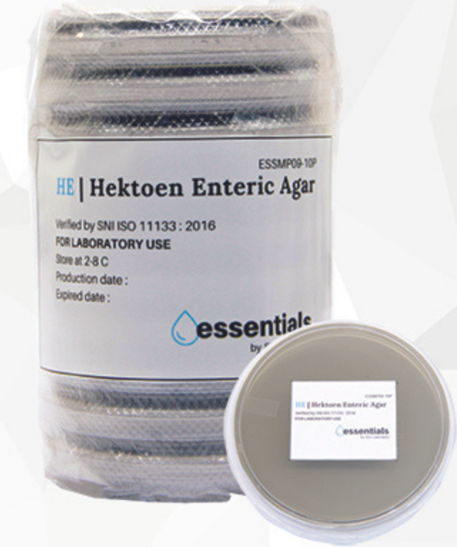
Hektoen Enteric Agar (HE)