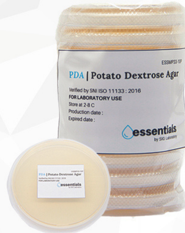
Potato Dextrose Agar (PDA)