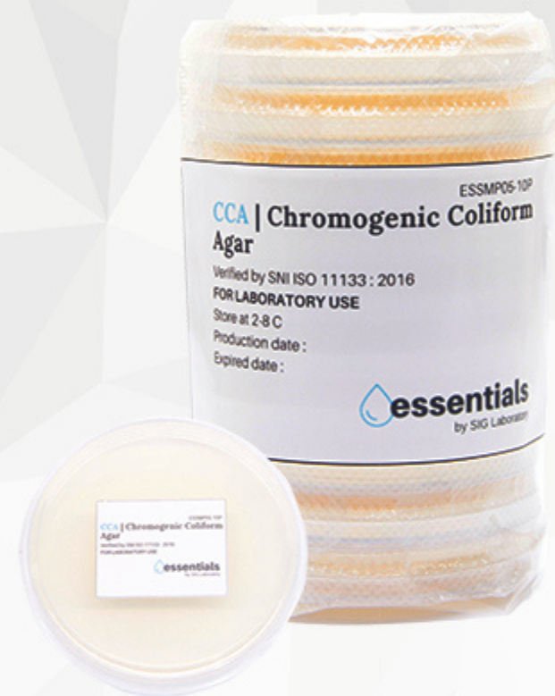
Chromogenic Coliform Agar (CCA)