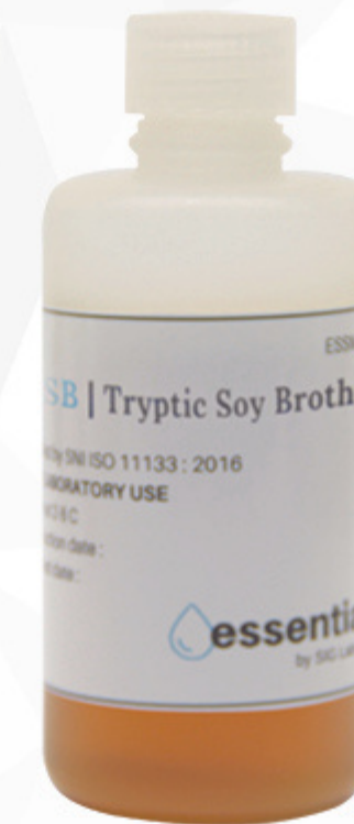
Tryptic Soy Broth (TSB) 100 ml