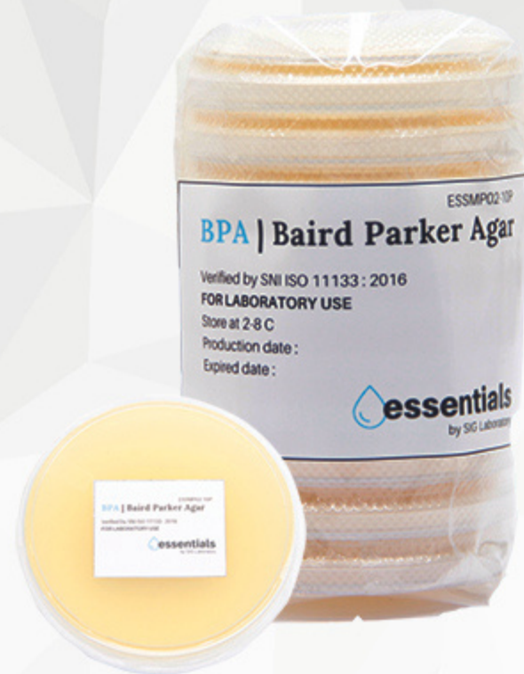
Baird-Parker Agar (BPA)