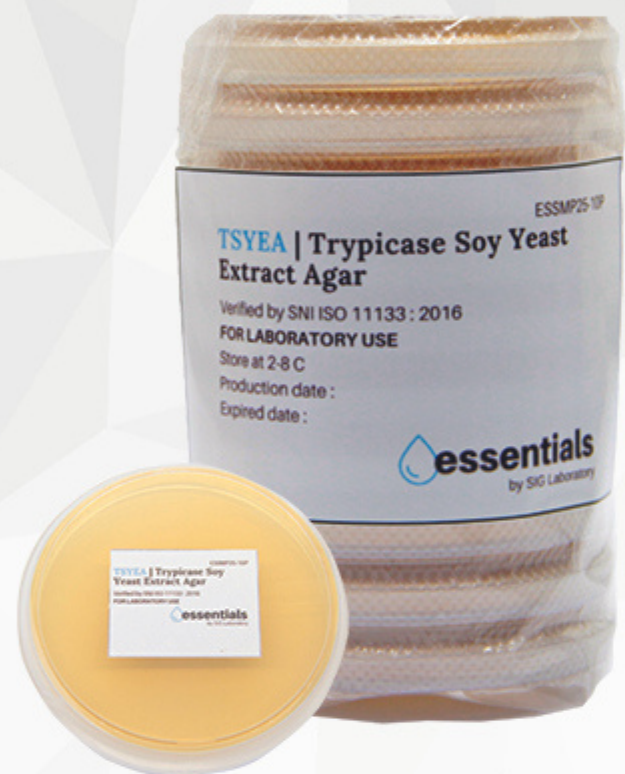
Tryptone Soya Yeast Extract Agar (TSYEA)