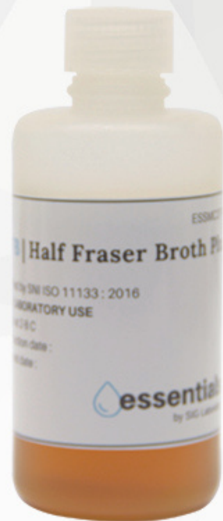
Half Fraser Broth Plus (HFB) 225 mL