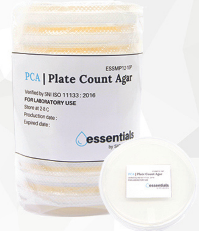
Plate Count Agar (PCA)