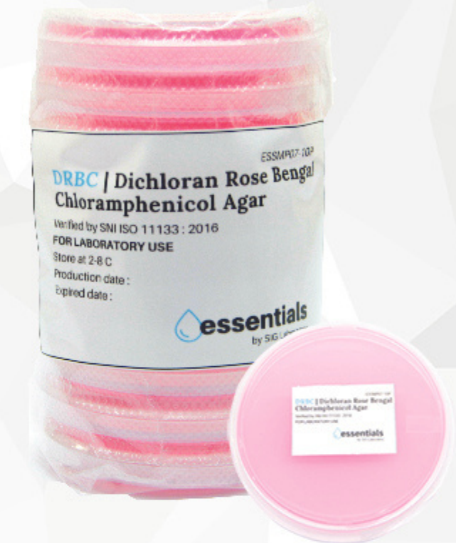
Dichloran Rose Bengal Chloramphenicol Agar (DRBC)