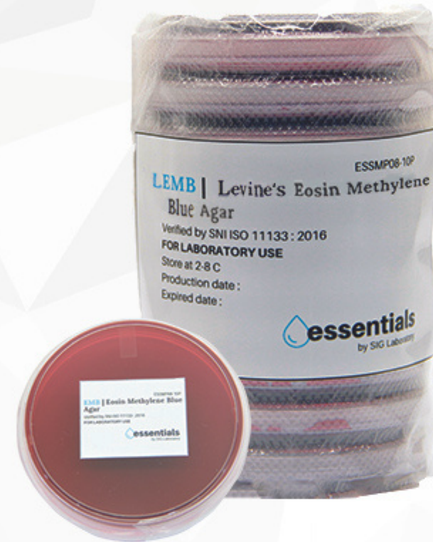
Levine's Eosin-Methylene Blue Agar (L-EMB)