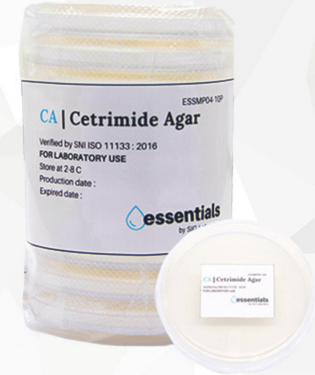
Cetrimide Agar (CA)