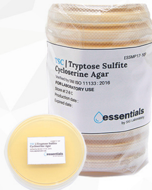
Tryptose Sulfite Cycloserine Agar (TSC)