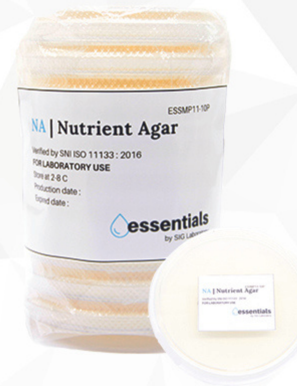
Nutrient Agar (NA)