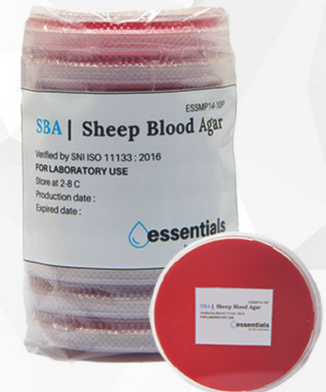
Sheep Blood Agar (SBA)