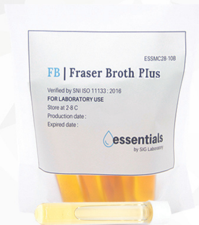
Fraser Broth Plus (FB)