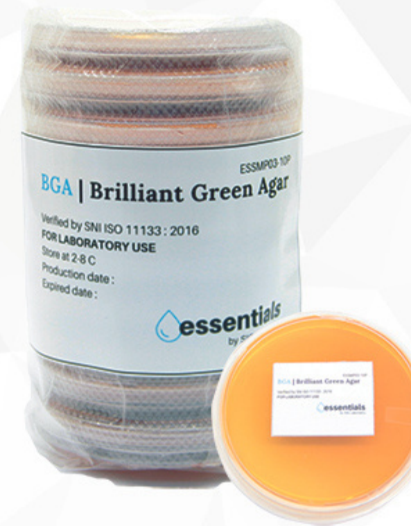
Brilliant Green Agar (BGA)