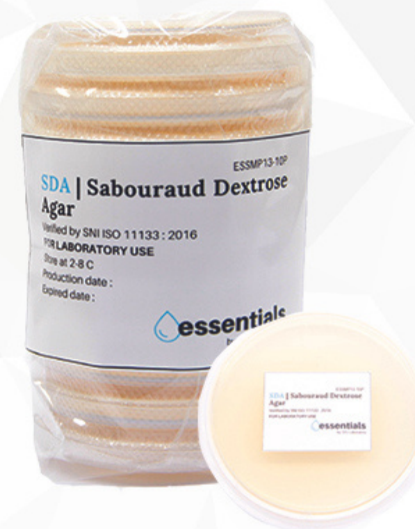
Sabouraud Dextrose Agar (SDA)