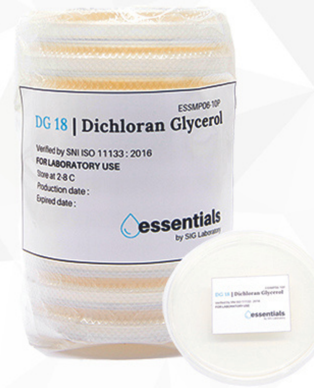
Dichloran Glycerol Agar (DG 18)