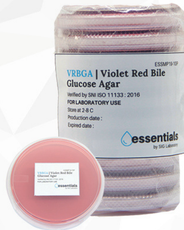
Violet Red Bile Glucose Agar (VRBGA)