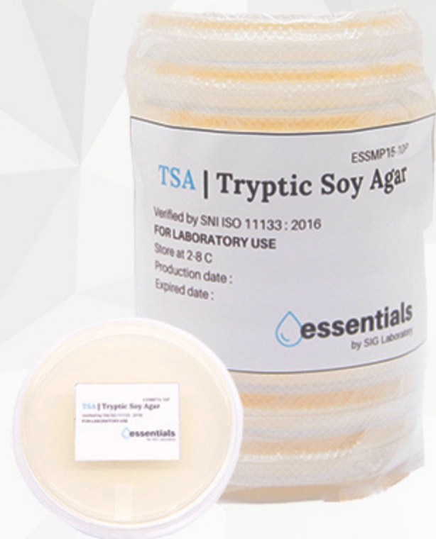
Tryptic Soy Agar (TSA)