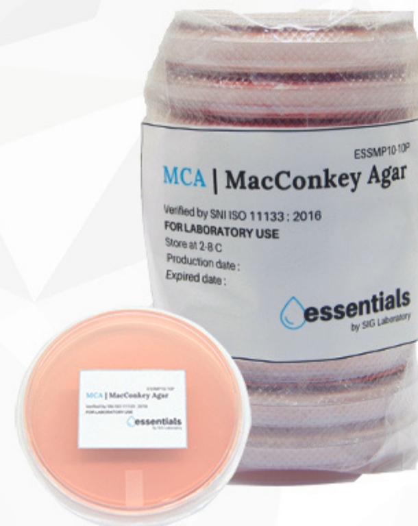
MacConkey Agar (MCA)