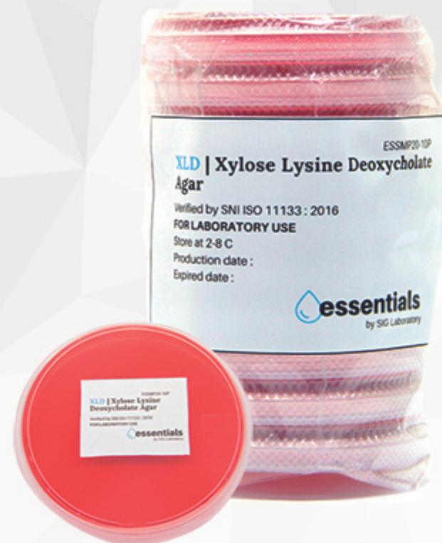
Xylose Lysine Deoxycholate Agar (XLD)